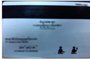
Driver License(Capable of detecting cards as long as they reach the standard)