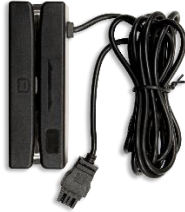
Magnetic Card Reader